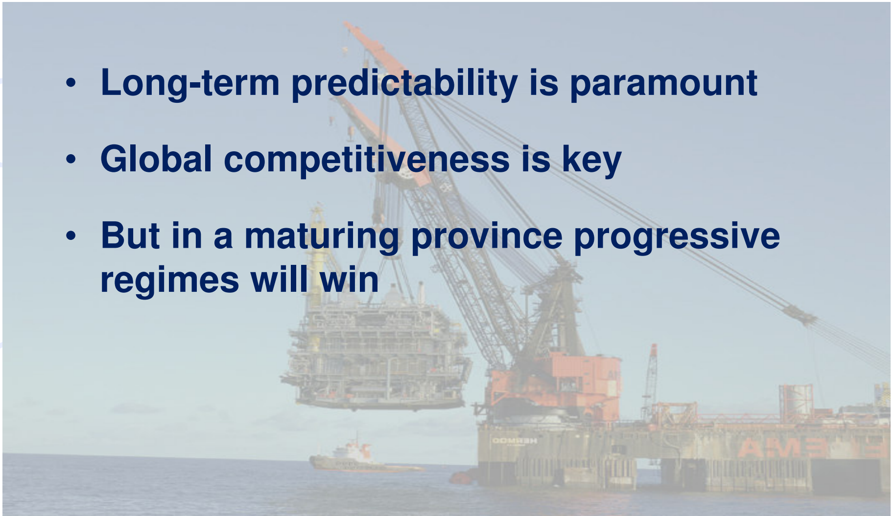
Photo: Dan 'F' production platform installation.